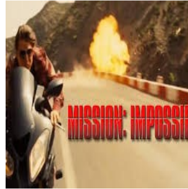
Tom cruise, the star of the movie, poses here in the movie poster

this movie is a great film and for a sequel it really has surpassed all expectations.